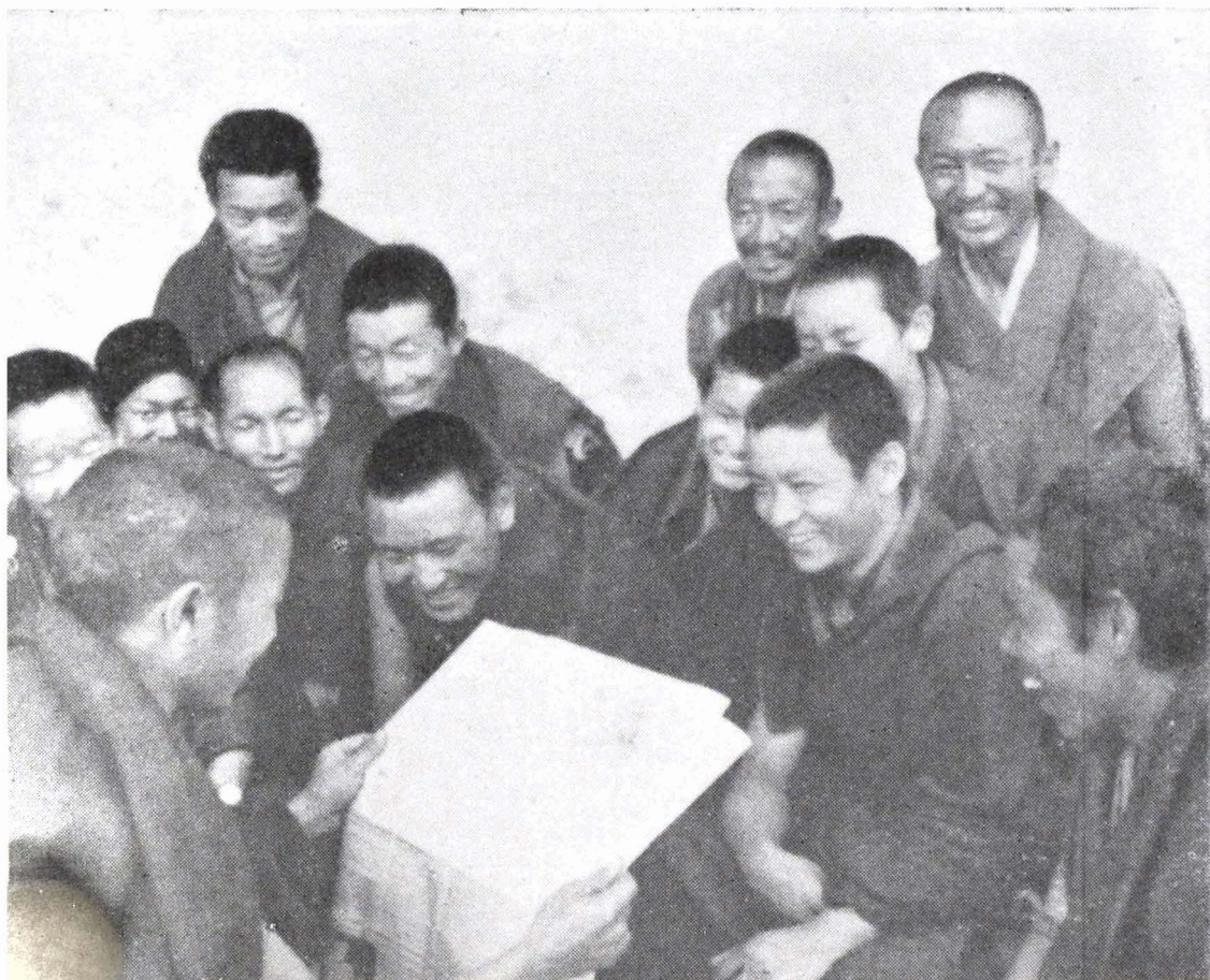
Poor lamas in Jokhan Monastery smile at "freedom of person"