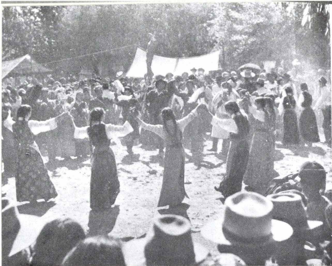
Lingka festival in Lhasa, June 22, 1959