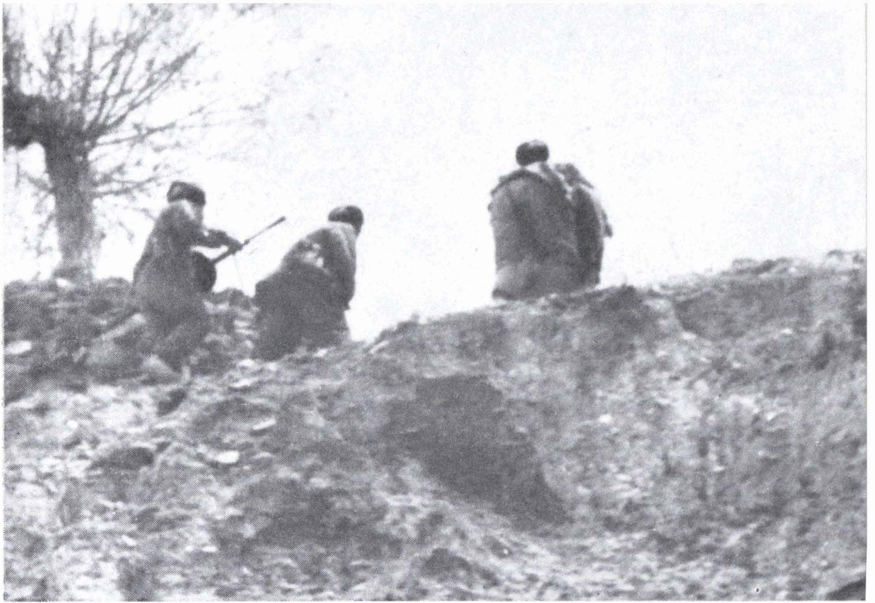
"The drive was up Yo Wang Hill, which we took in about three hours."