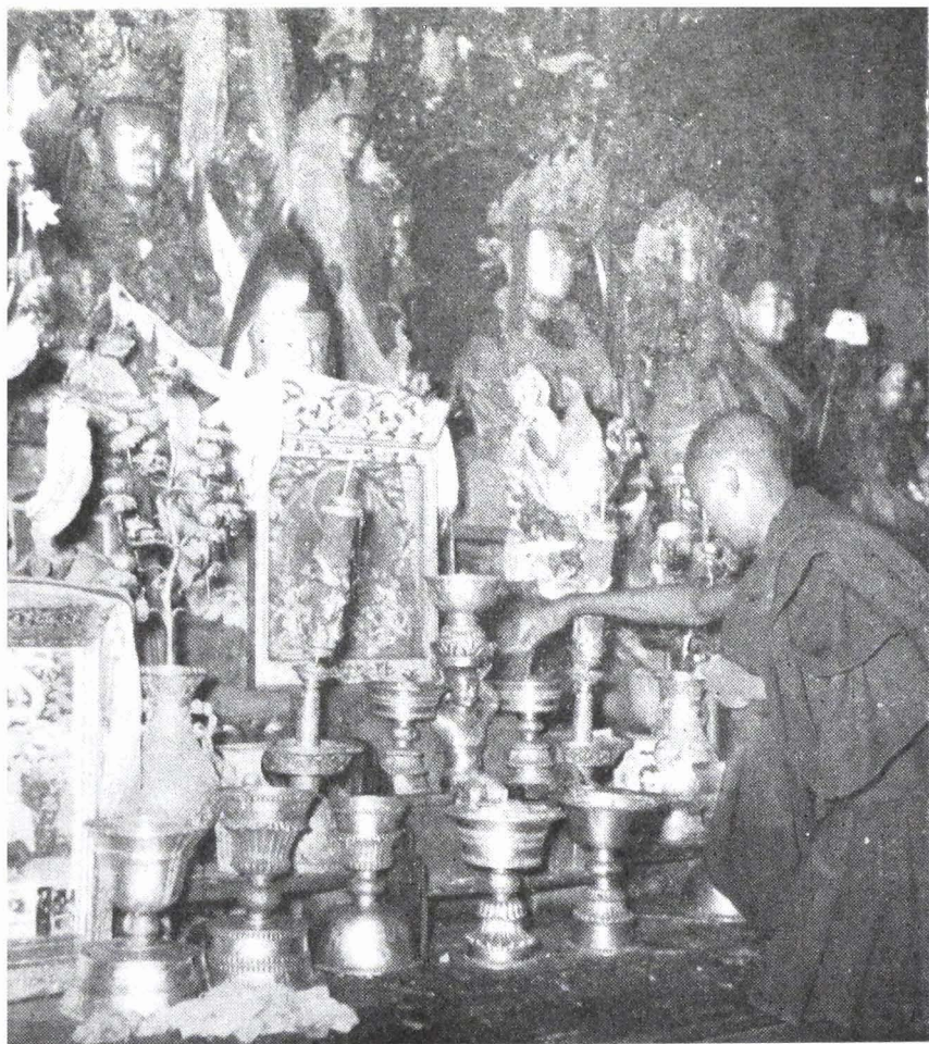
Sacred objects checked in Lhasa. They are all there