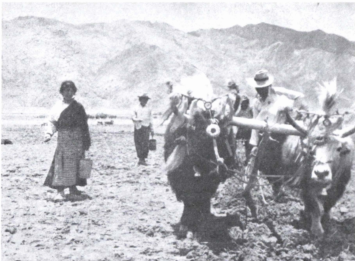
"Crops to the Cultivators" on Lhalu's confiscated manor

Loka peasants in support of the "three abolitions," anti-rebellion, anti- ula , and anti-servitude