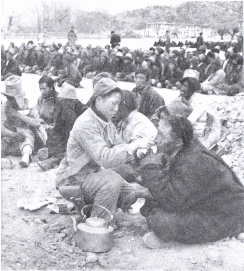
P.L.A. medical worker treats wounded captives