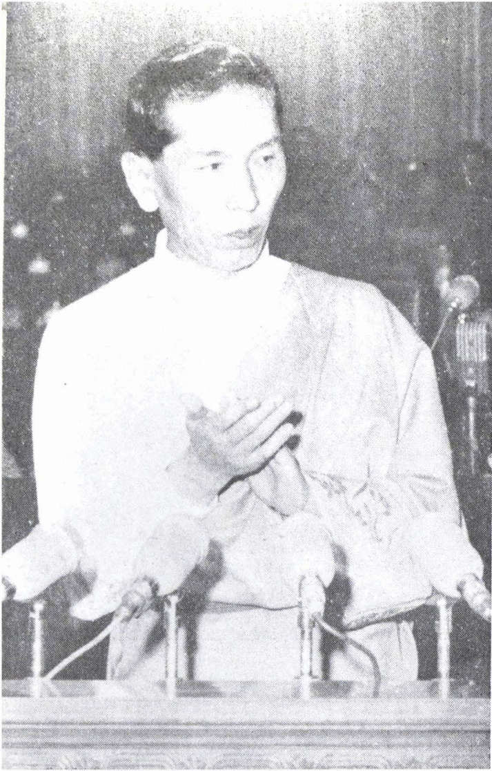
Apei, deputy from Tibet, addresses the National People's Congress of China