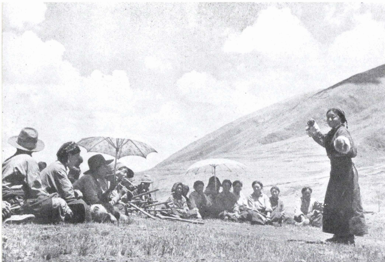
A new co-operative at rest interval (Kantse)