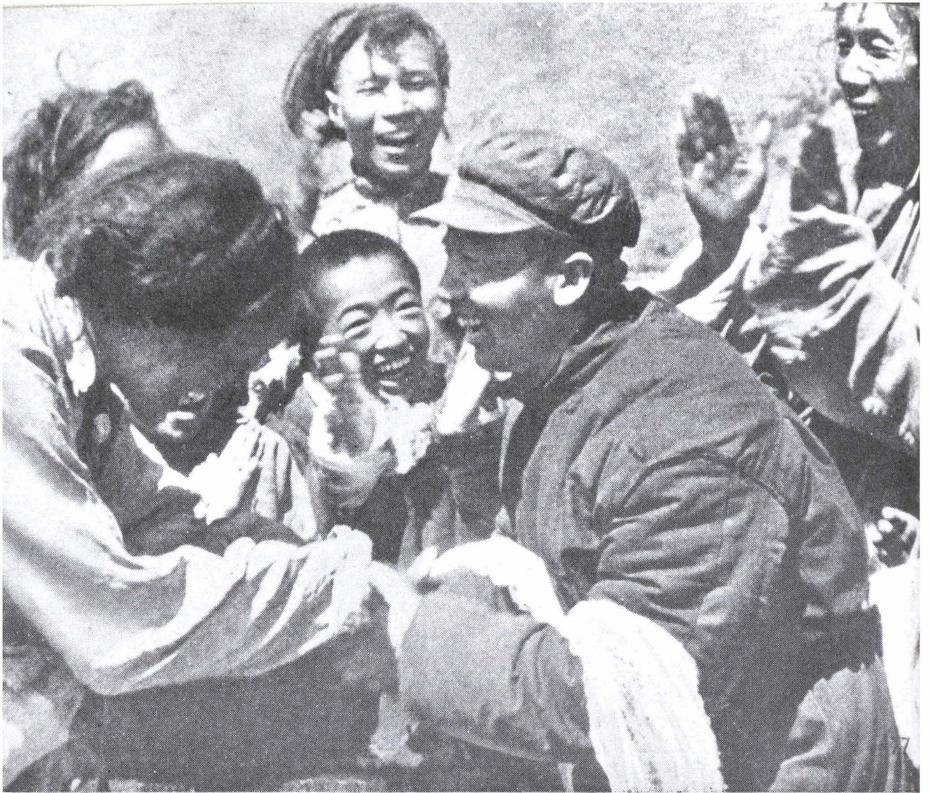
Herdsmen thank P.L.A. medical team for help with animals