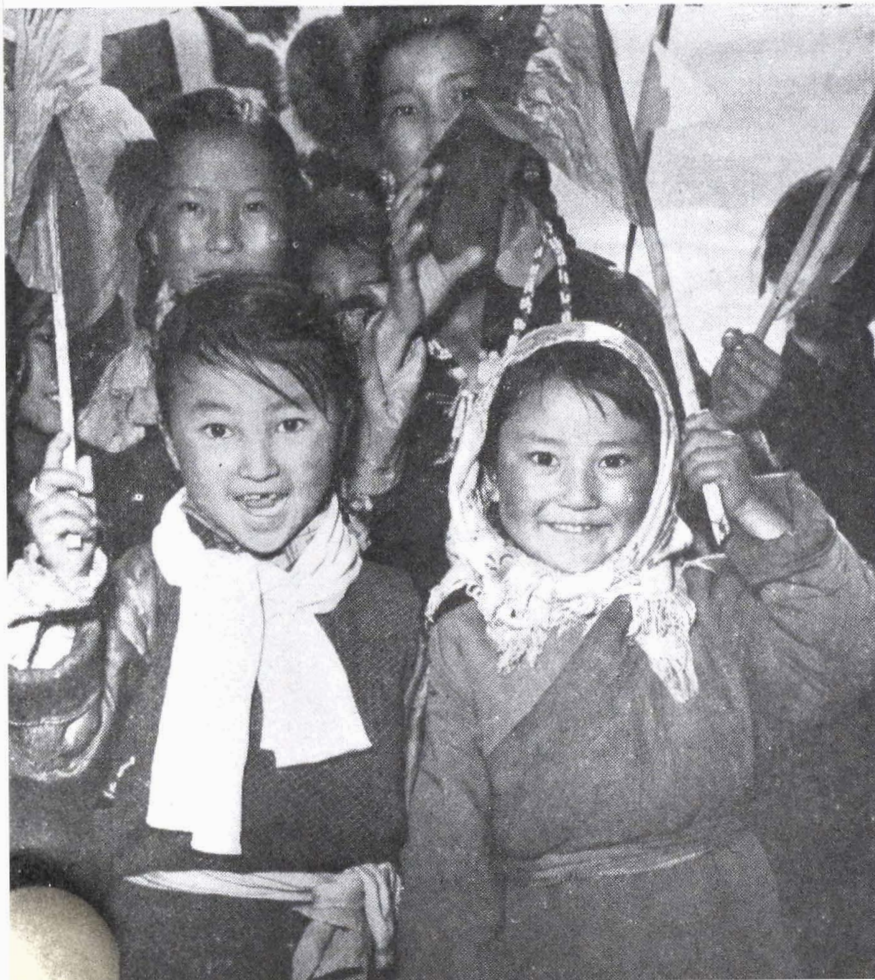
Lhasa demonstration celebrates quelling of rebellion