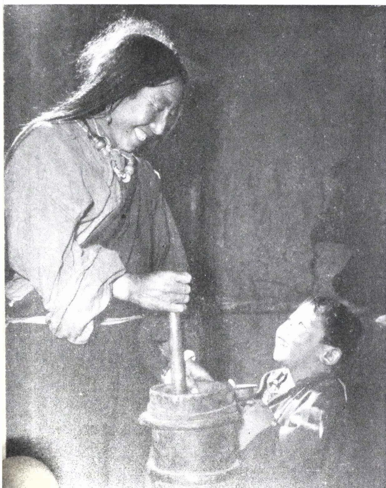
"Ma, I want buttered tea." Former serf, now member of a Kantse co-operative, churns the unaccustomed tea