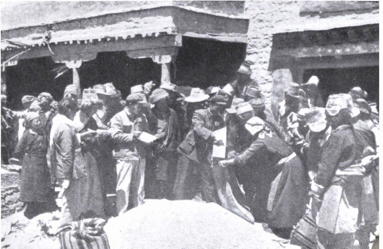
Seed given out to peasants the rebels looted