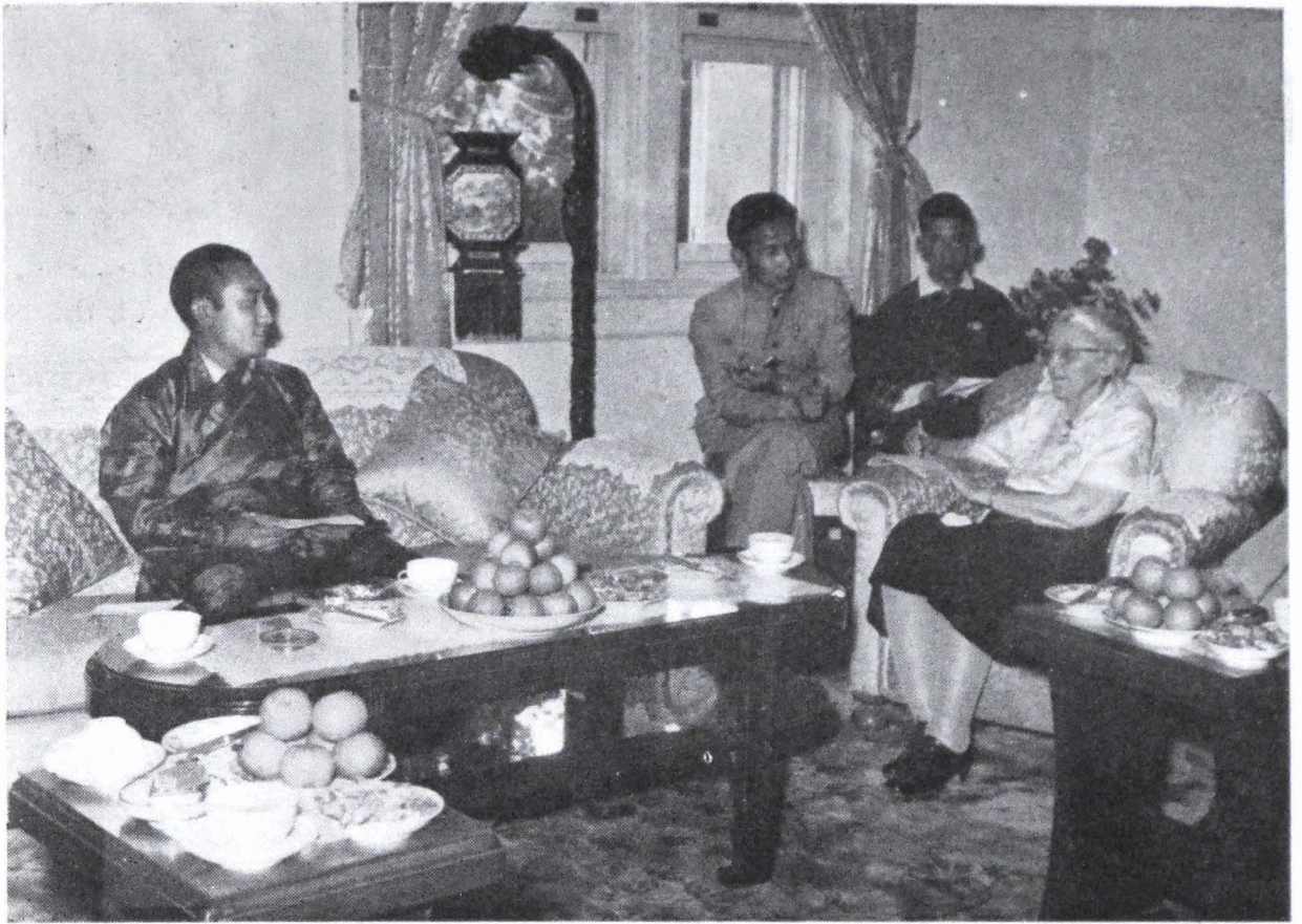
The author asks Panchen Erdeni about future reforms