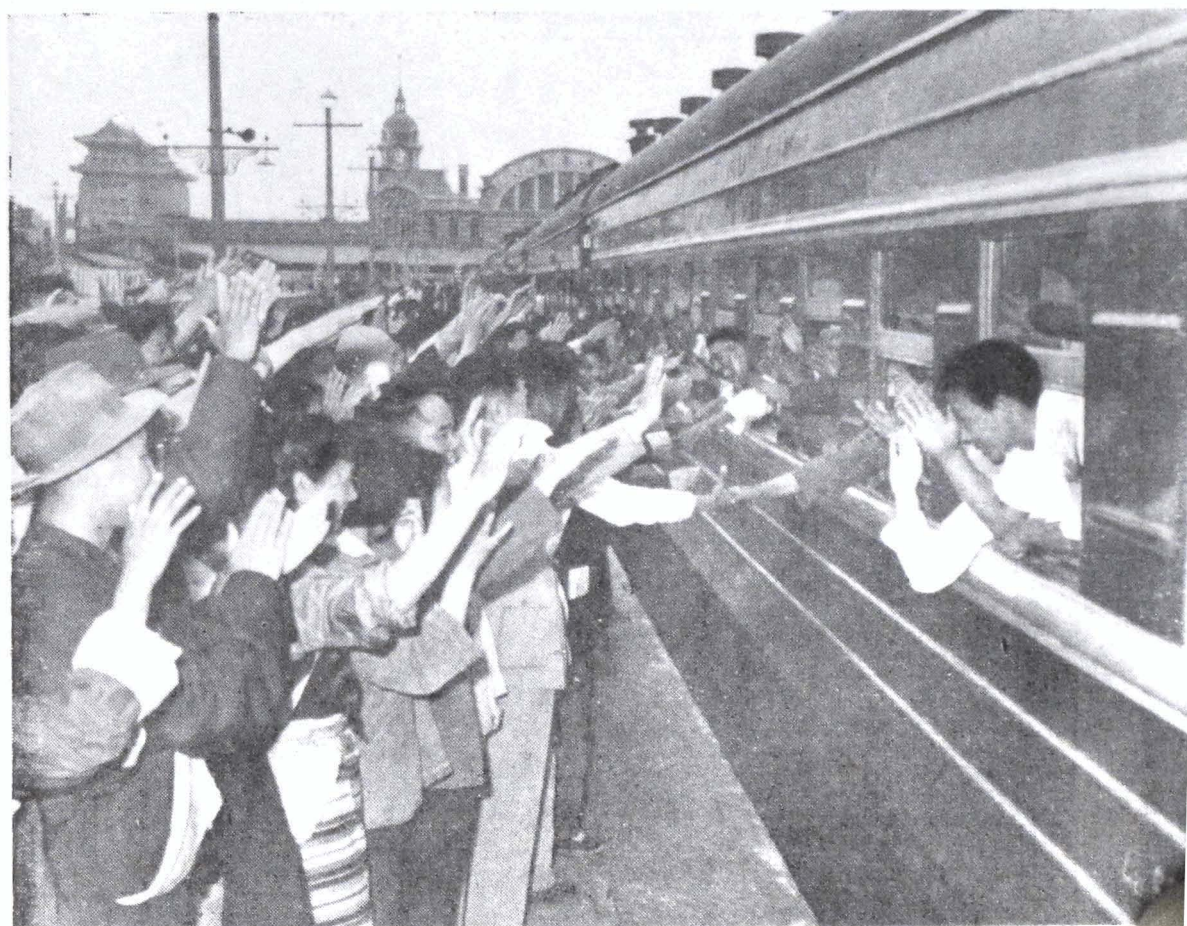
The former runaway serfs are off to Lhasa