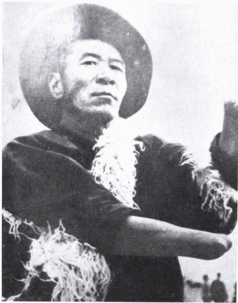
Going to the meeting to accuse the pasture lords

The herdsman accuses: "That lord beat off my hands when I opposed his taking my wife."