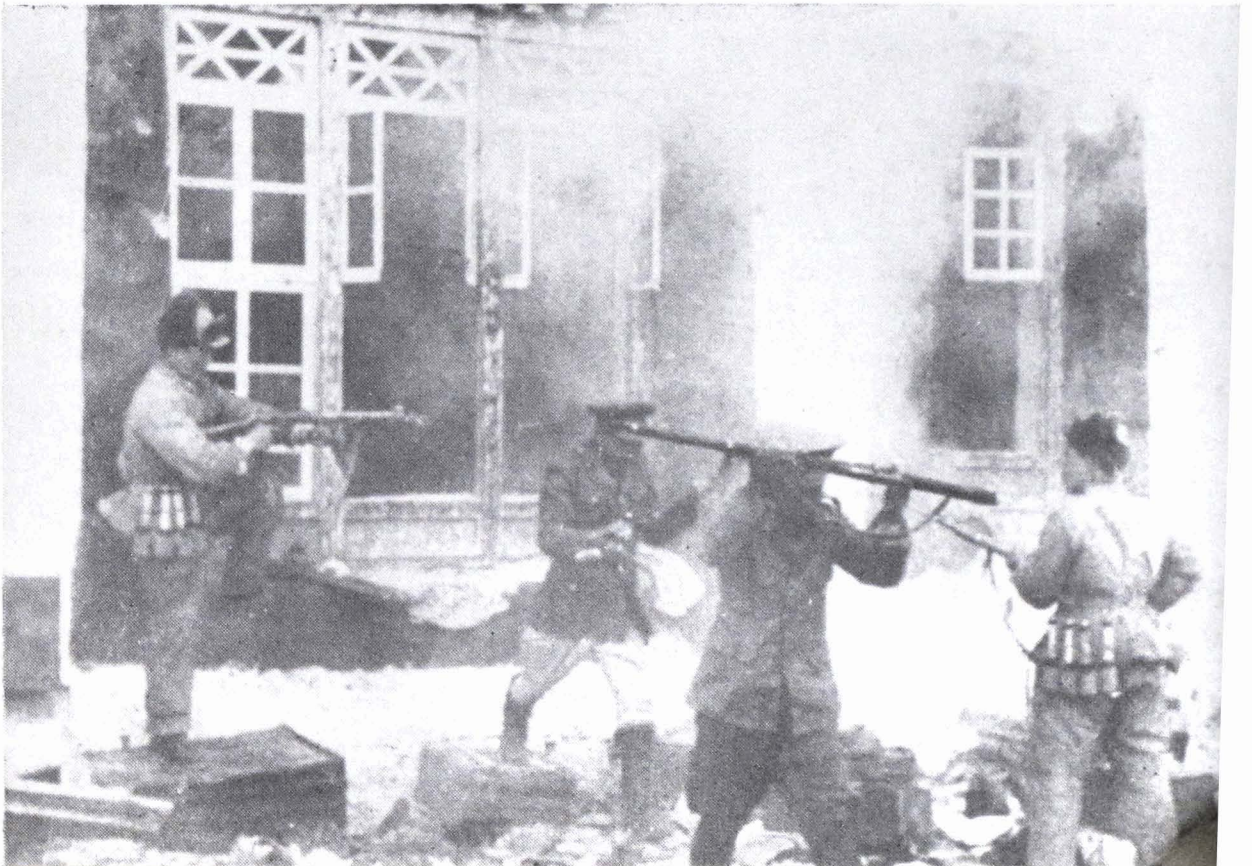
Rebels come out to surrender